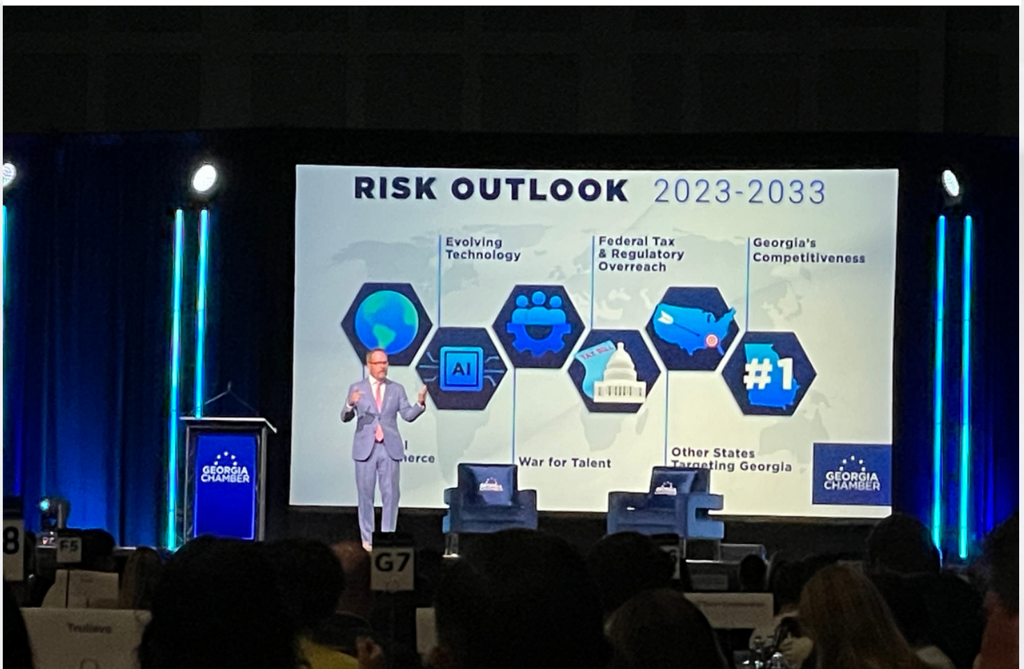
Georgia Chamber Congressional Luncheon