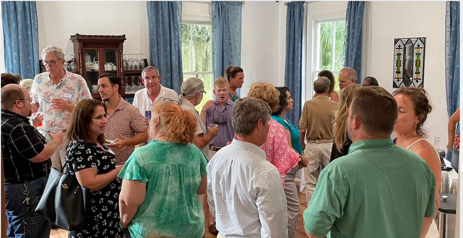
Business After Hours at The Canopy