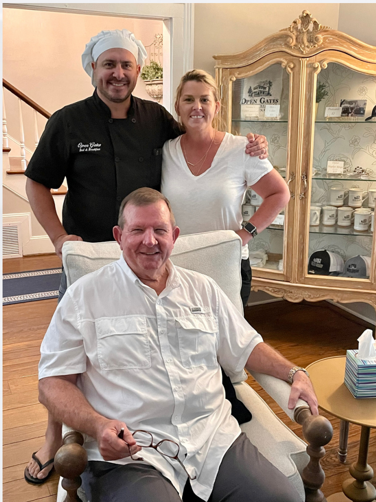
The Last Laird of Sapelo Book Launch & Signing