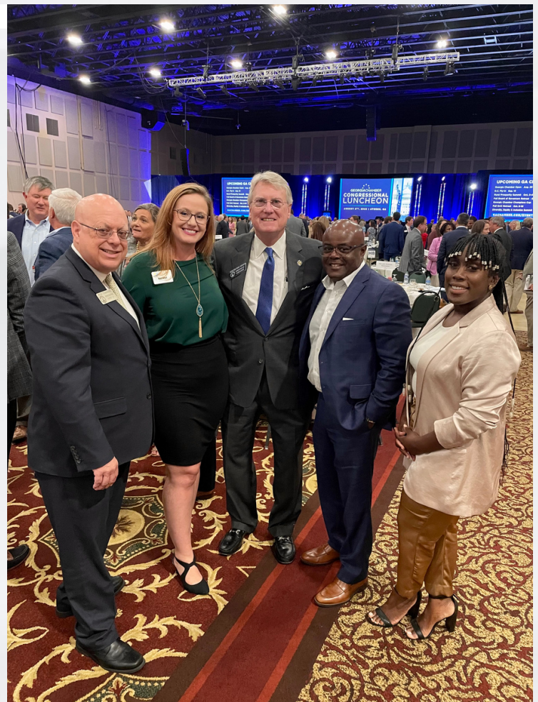
Georgia Chamber Congressional Luncheon