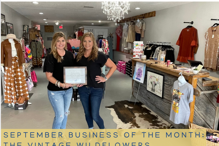
SEPTEMBER BUSINESS OF THE MONTH: THE VINTAGE WILDFLOWERS