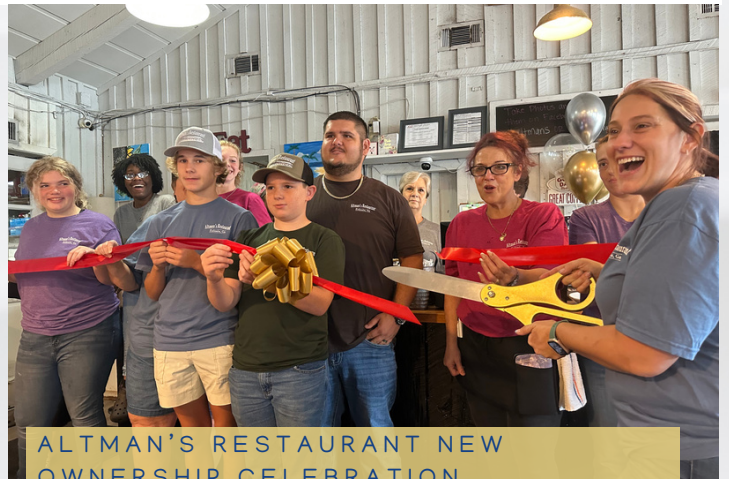
ALTMAN'S RESTAURANT NEW OWNERSHIP CELEBRATION