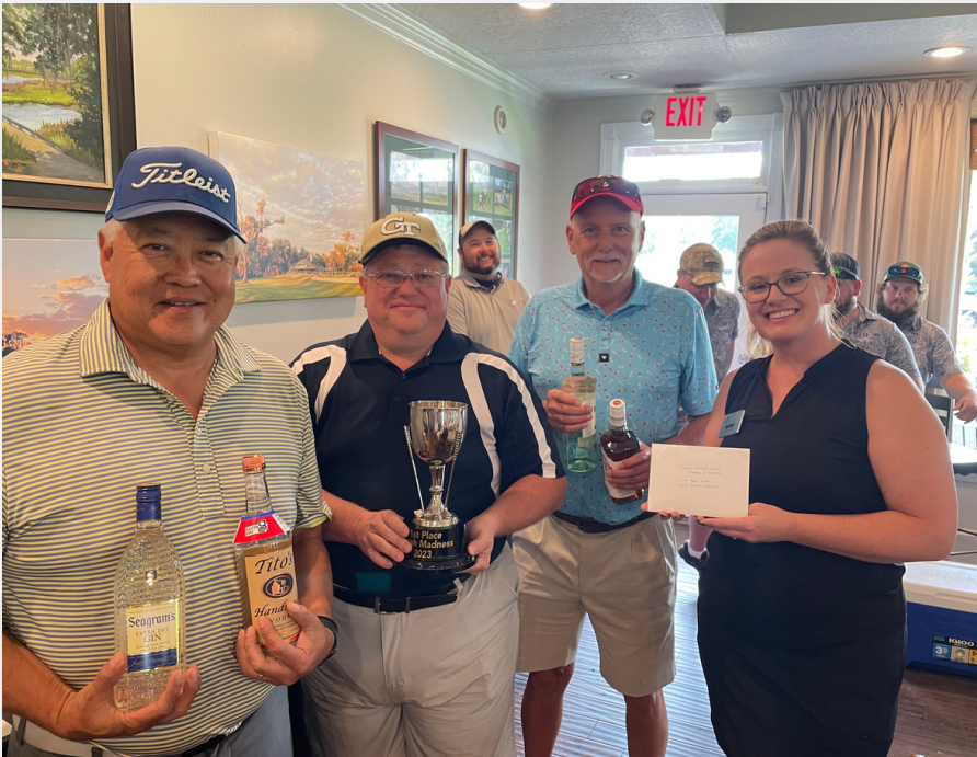
1ST PLACE WINNER: SNF HOLDING