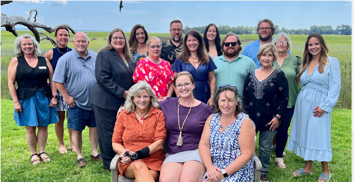
BOARD RETREAT 2023