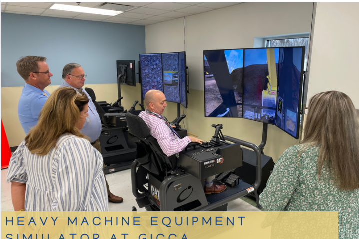
HEAVY MACHINE EQUIPMENT SIMULATOR AT GICCA