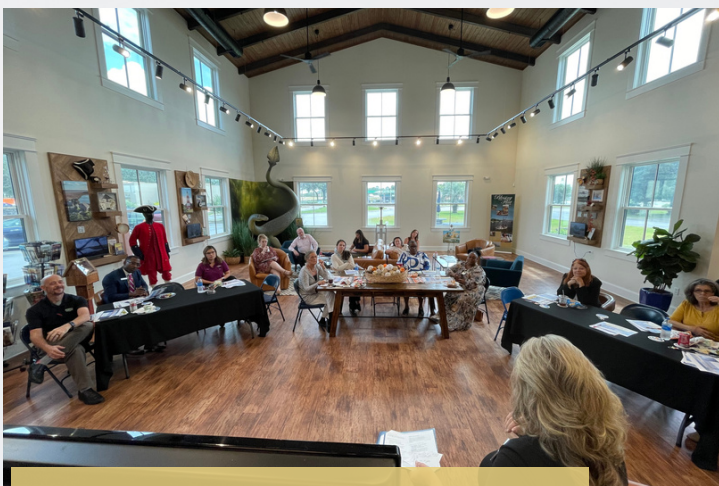
LUNCH & LEARN: CHAMBER 101