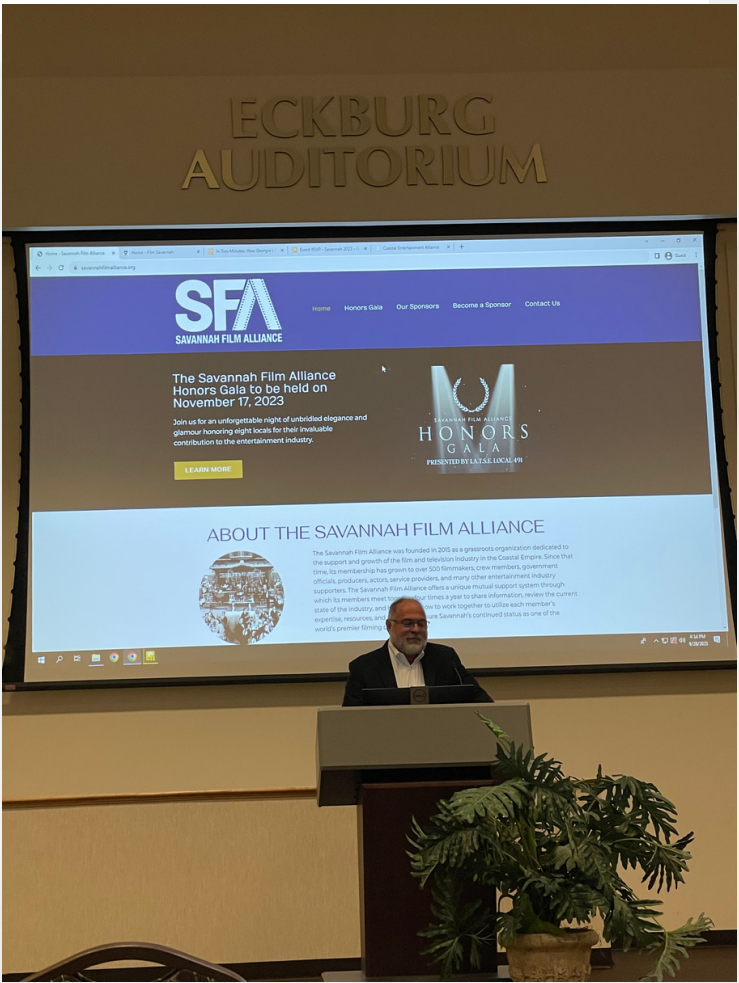
SAVANNAH FILM ALLIANCE