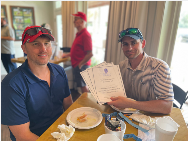
3RD PLACE WINNER: SOUTH COAST BANK