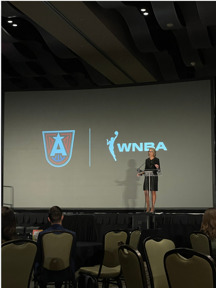
EXPLORE GEORGIA GOVERNORS TOURISM CONFERENCE