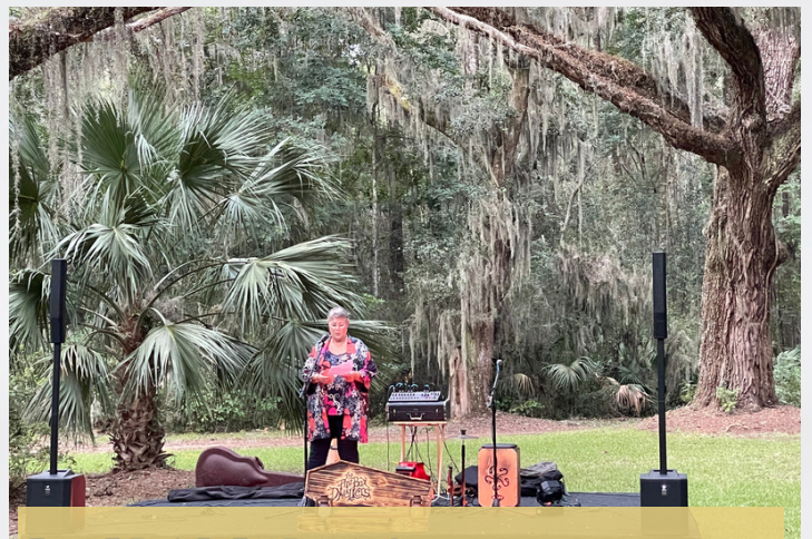
TASTE OF THE WILD