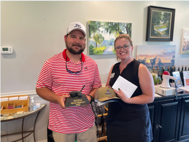
2ND PLACE WINNER: MCINTOSH COUNTY COMMISSION STAFF