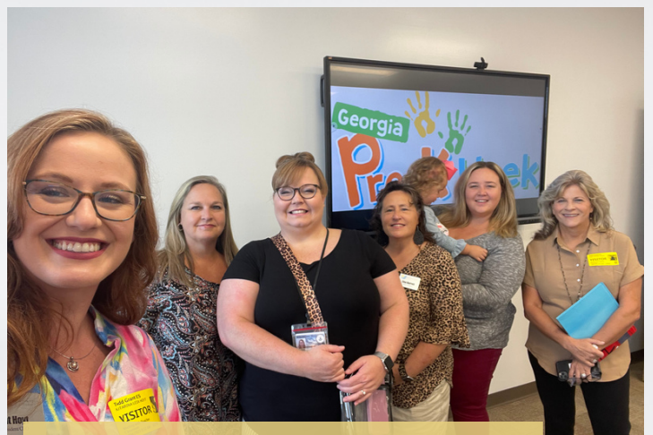
GEORGIA PRE-K WEEK