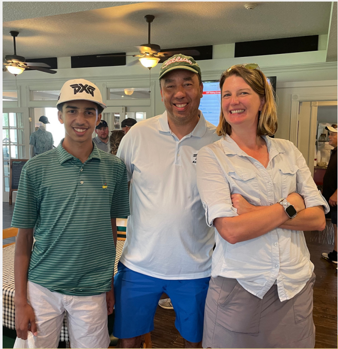
SAPELO CHALLENGE WINNER