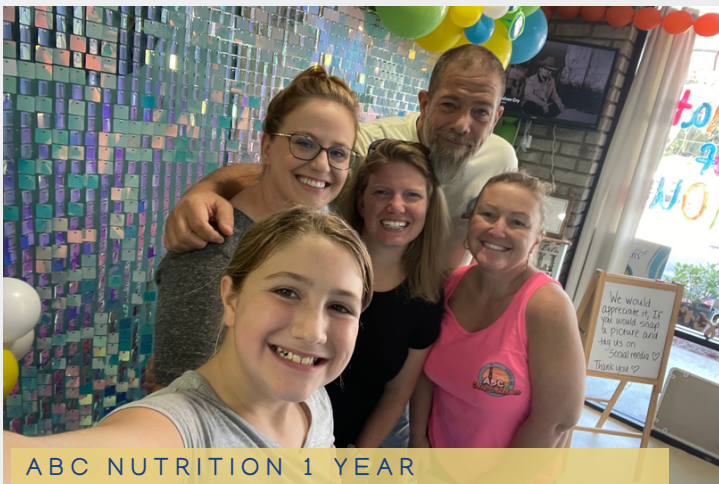
ABC NUTRITION 1 YEAR ANNIVERSARY