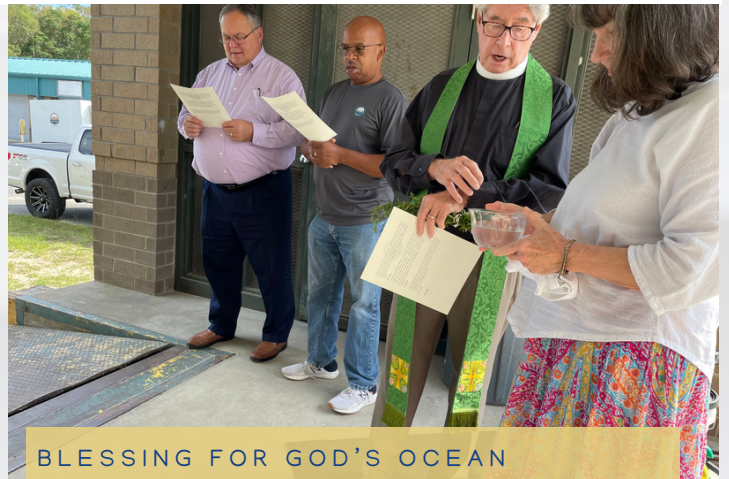
BLESSING FOR GOD'S OCEAN