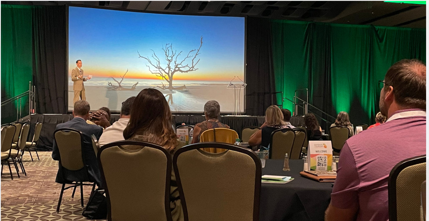
EXPLORE GEORGIA GOVERNORS TOURISM CONFERENCE