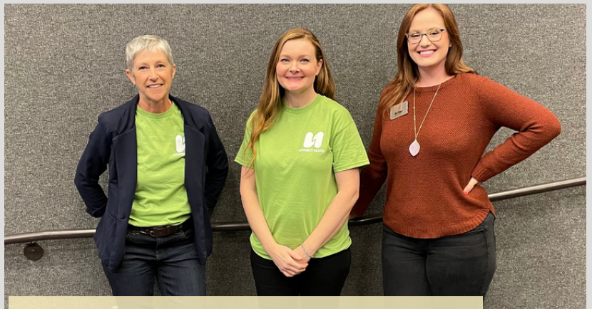
TEACHER EXTERN PARTICIPANTS