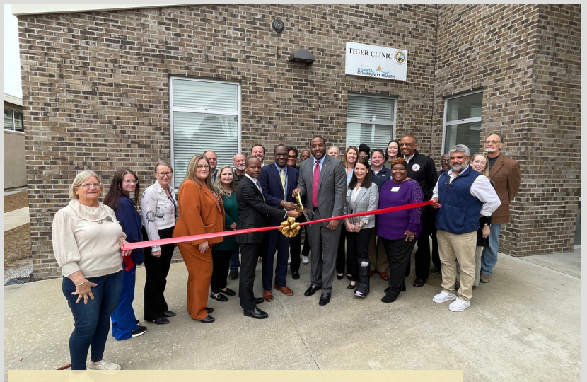
TIGER CLINIC RIBBON CUTTING