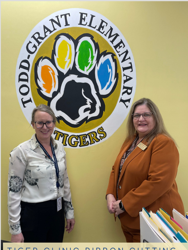
TIGER CLINIC RIBBON CUTTING