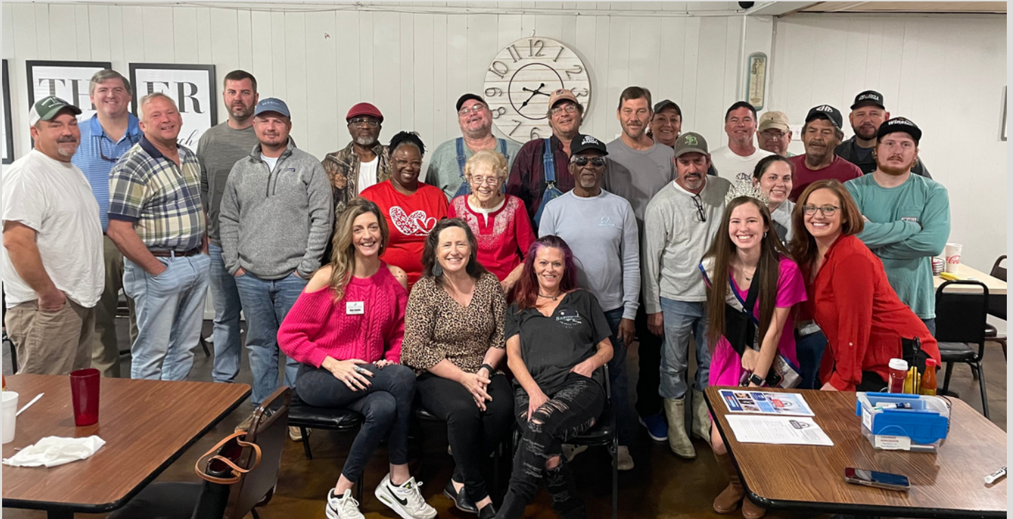
FISHERMANS BREAKFAST 2024