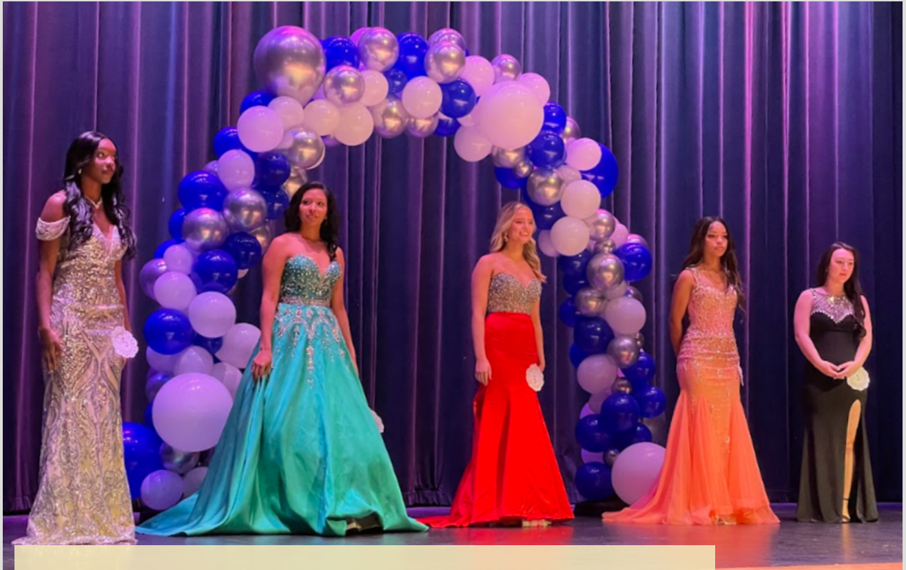
MISS BLESSING OF THE FLEET PAGEANT