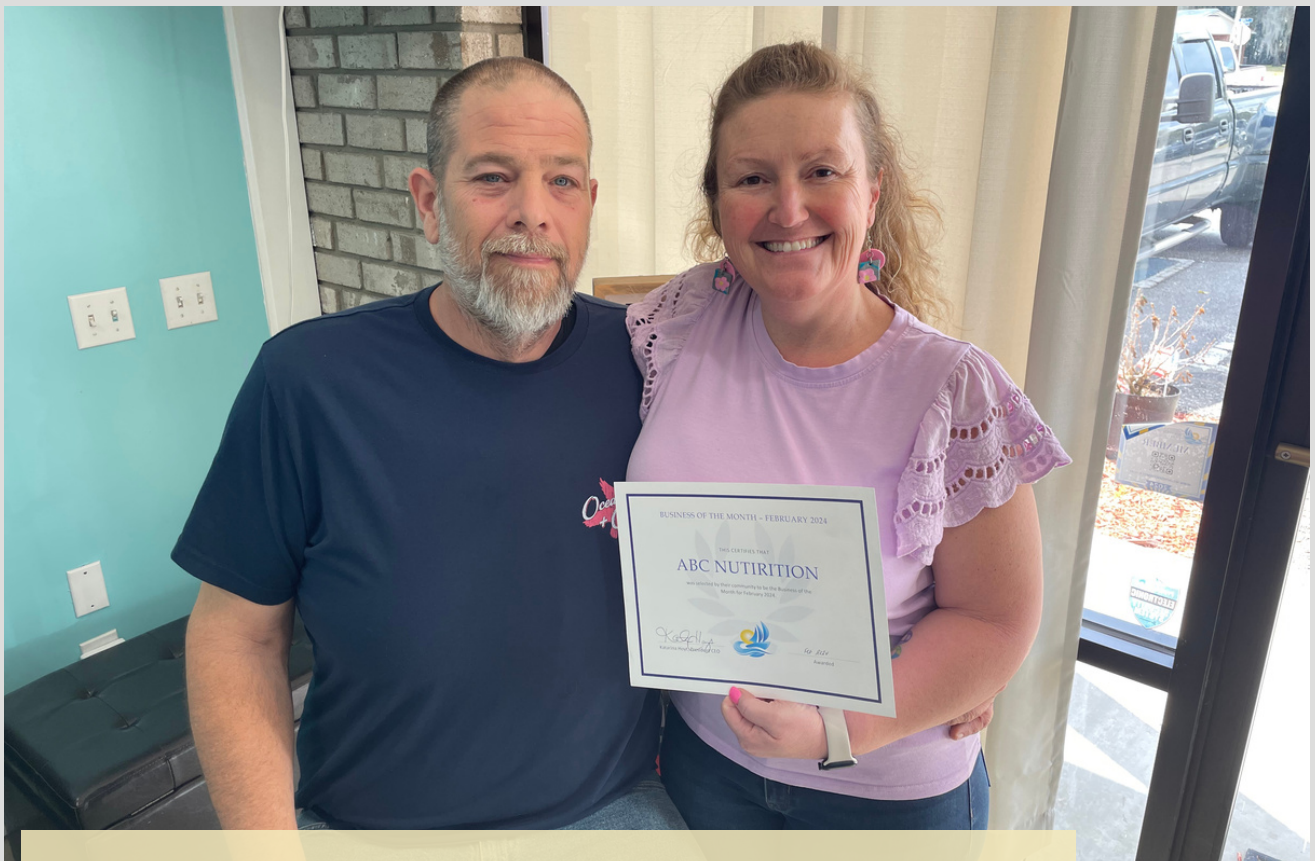
BUSINESS OF THE MONTH: ABC NUTRITION