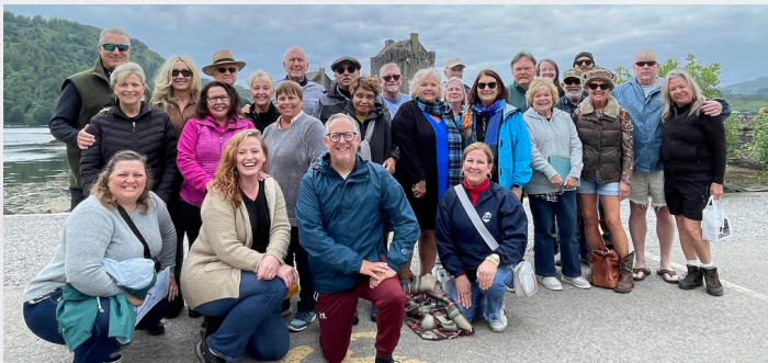
CHAMBER TRIP TO SCOTLAND