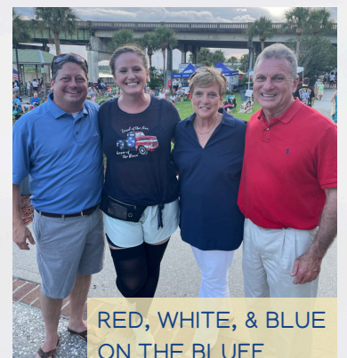
RED, WHITE, & BLUE ON THE BLUFF