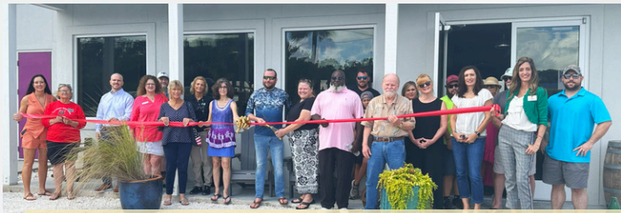
RIVERS EDGE RIBBON CUTTING