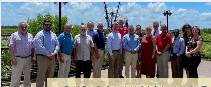
DNR COMMISION VISIT