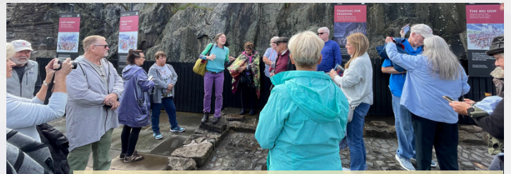
CHAMBER TRIP TO IRELAND