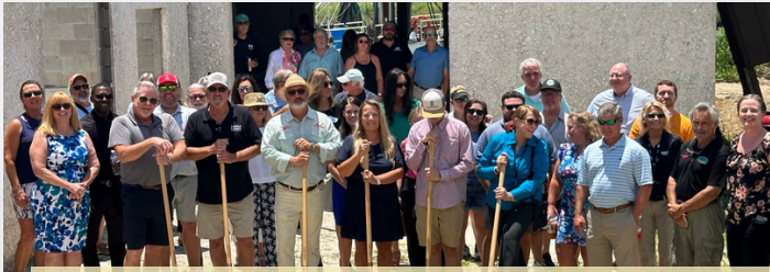
Marsh Pirate Ground Breaking