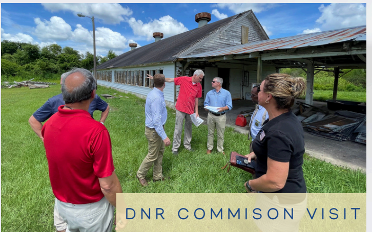
DNR COMMISION VISIT