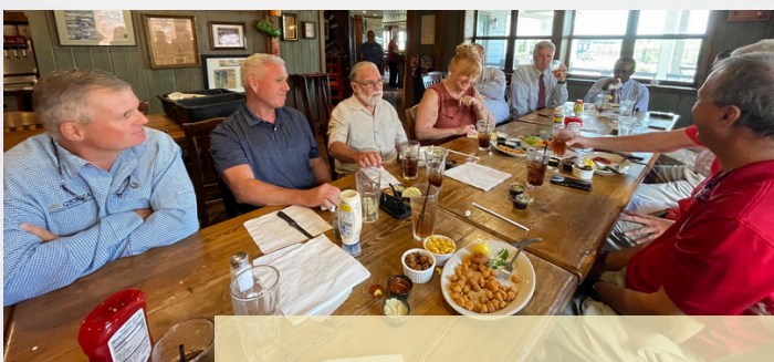
DNR COMMISION VISIT